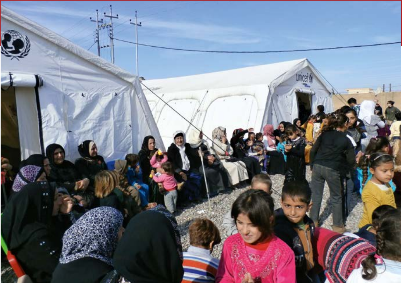
Refugee camp in Libanon