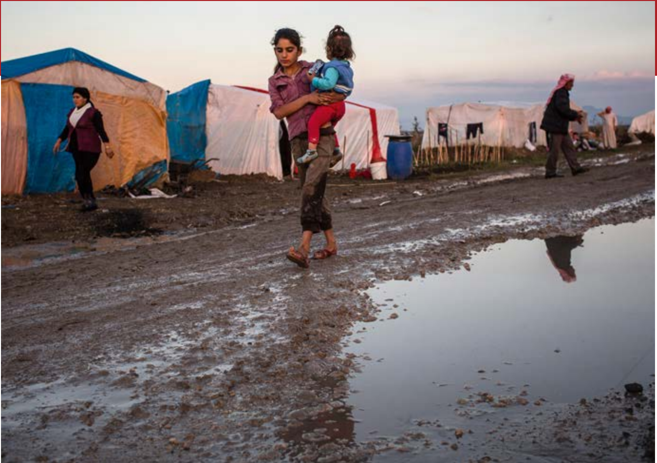
Refugee camp in Turkey

The EU provided the maximum possible amount of 930,997,848 EUR in December 2015 according to its ›Worldwide Decision‹ on financing humanitarian aid operational priorities. 28 With its recently updated contribution to the Syria Regional Crisis, the Humanitarian Implementation Plan (HIP) will now provide an additional amount of 130 million EUR in 2016 on top of its previous allocation of 330 million EUR to address the increasing humanitarian needs of displaced people and refugees in Syria as well as in Turkey, Lebanon and Jordan. 29 Finally, on 4 February 2016, the UK,