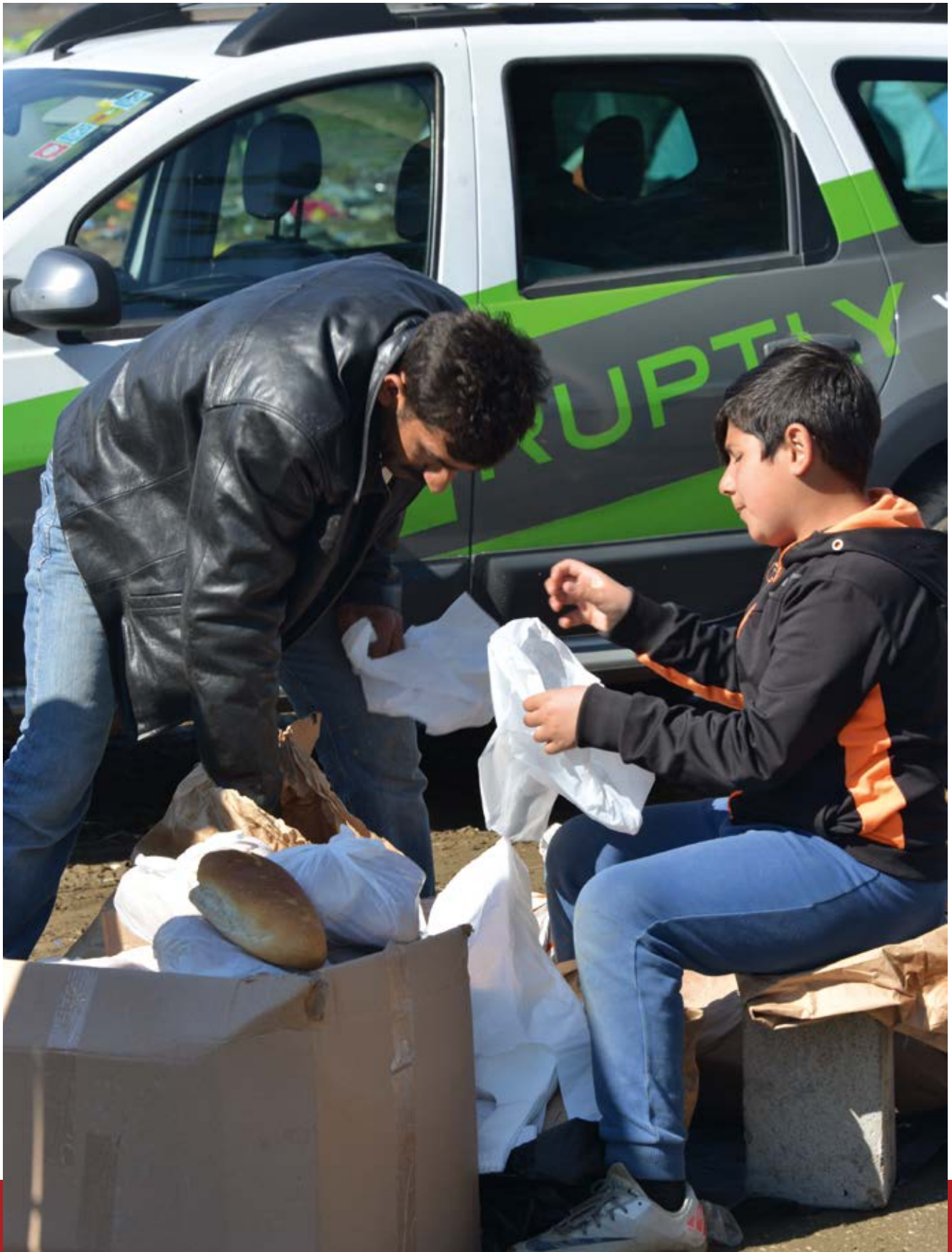
Greece: refugee child selling pastries in the street