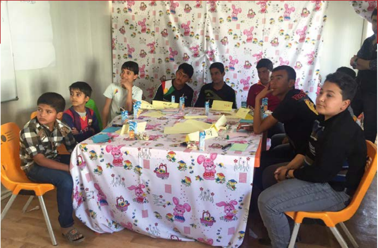
Northern Iraq: Workshop with children in a terre des hommes Italy project

reported that their main reason for working was to support their families. According to them, poverty and having family members who are unable to work are the main determining factors for child labour. Besides this, the children reported that strong family values, peer pressure and prejudiced views on education also prevented them from attending school – pushing them into child labour. 161