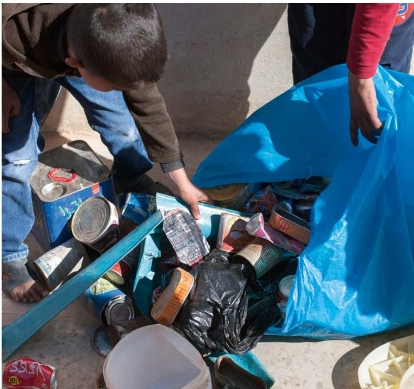
Children collecting scrap metal in a Jordanian refugee camp

think that working children are beggars when selling at traffic lights. « Similarly, religious values play an important role when boys define the types of work that they should not do. For example, a group of boys explained that they »should not do illegal trade such as alcohol, prostitution, stealing because it is against Islam.« 77