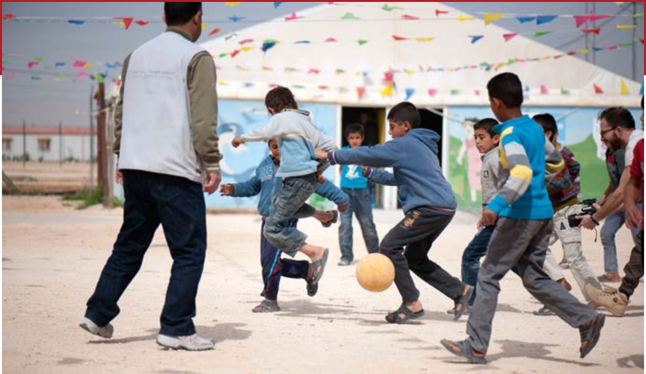
terre des hommes in Jordan: sport supports children in coping with traumatic experiences

Jordan – not only for Jordanian children but also for refugee children. However, access to school is difficult for many reasons. First, children are often withdrawn from school when sent to work. 89 Second, schools are often overcrowded and far away so that transportation costs can be a barrier. Third, a low interest level of the children for education, which has different causes, often prevents them from attending classes. Finally, growing tensions among local and refugee children, mentioned in interviews with the Terre des Hommes' North Field Coordinator, may cause school violence due to the lack of space and overcrowded classes 90 . This might also prevent refugee children from attending. Generally, a high necessity for social inclusion activities to achieve a greater integration of Syrian refugee children at school level and in their local communities and to encourage children not to drop out of school and to feel less discriminated has been identified by Terre des Hommes. Improving access to education can be seen as a decisive step in preventing child labour. Therefore, the NGOs are now trying to scale up non-formal education activities in order to promote and facilitate school enrolment.