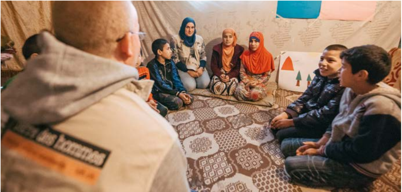
Libanon: support to a refugee family in a project of Terre des hommes Lausanne