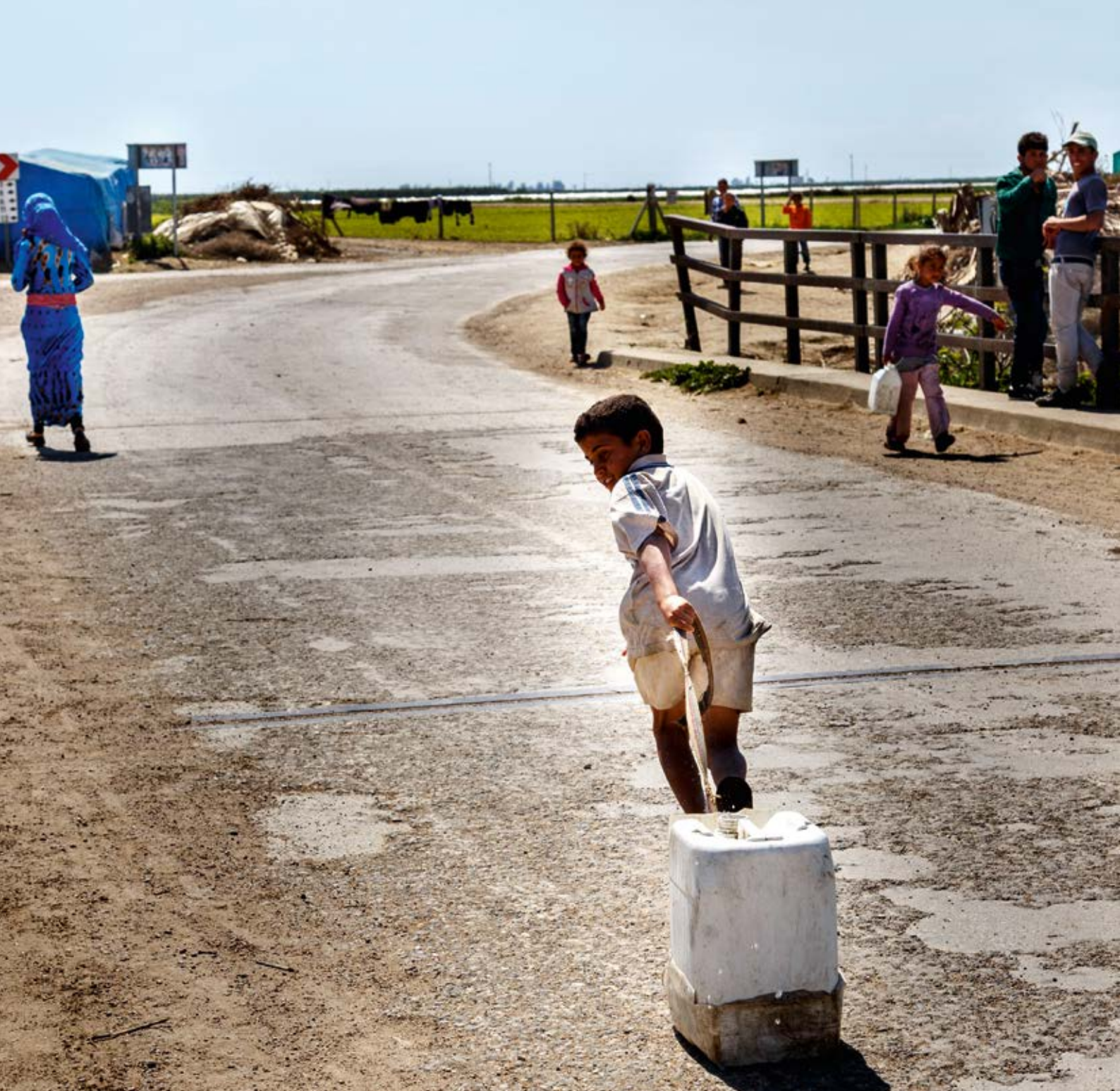
Child labour near a refugee camp

Until October 2015, most refugees headed on to Europe via Macedonia, Serbia and Hungary after passing through Greece. Since the closure of the Hungarian border in October 2015, the flow has been through Croatia, Slovenia and Austria. All countries along the Balkan Route are not only struggling with the high influx of refugees but also with the socio-political impact. Greece was hit hard by the deep economic recession which started in 2010 and which has severely affected the living conditions of the Greek population. According to EU information, the overall risk of poverty and/or the social exclusion rate reached 36 % in 2014.