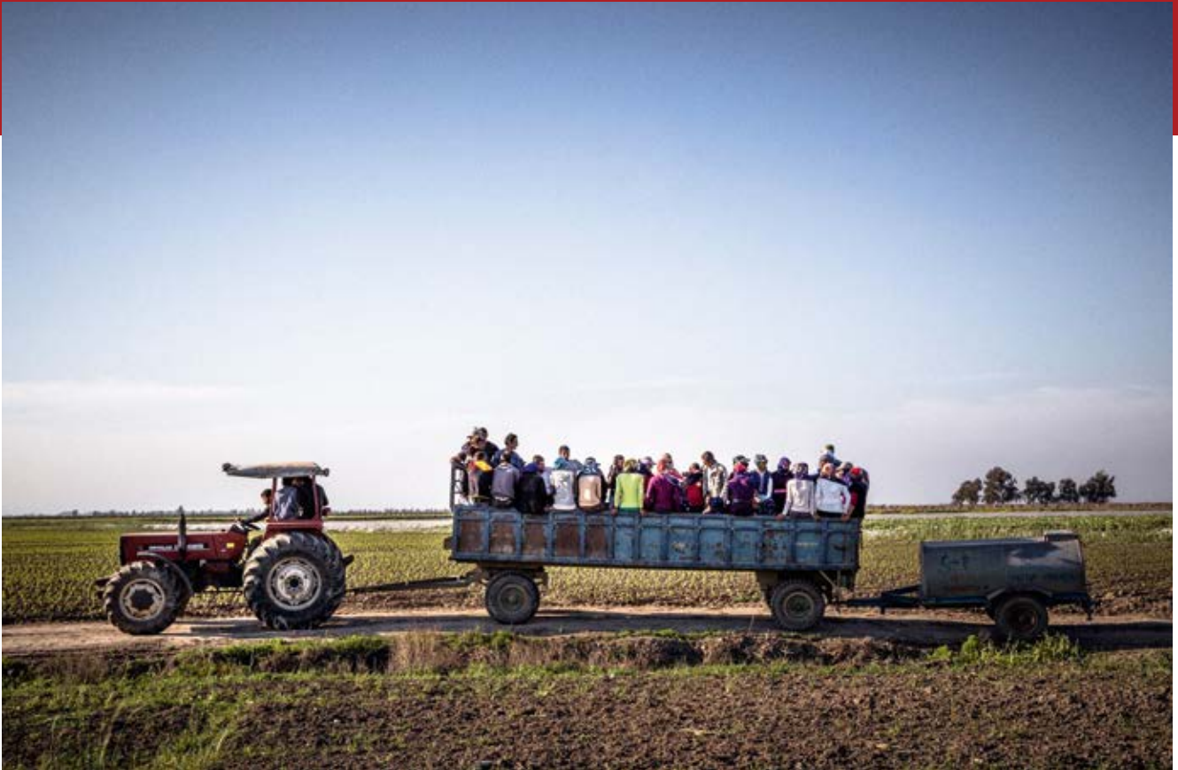
Turkey: on the way to the harvest

us then, because our father disappeared in Syria and as he was the oldest in the family he had to take care of us.» 206