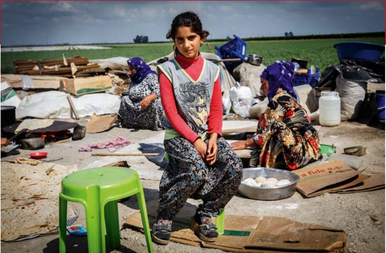
Turkey: Break from the field work. Young girl during the harvest.

8987/2012. 133 Applying these regulations in practice is difficult as »light work« is not defined in the Labour Code. Moreover, Art. 7 of the Labour Code excludes domestic workers and employees in the agricultural sector. 134