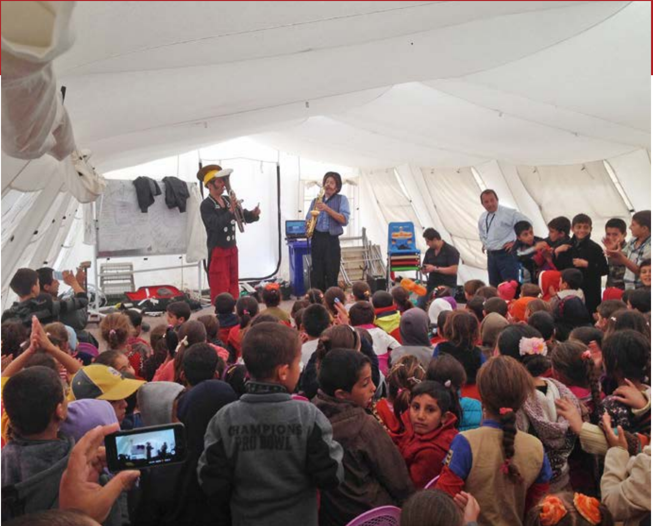
Children's amusement in a refugee project of terre des hommes Netherlands

money or food items, as well as marrying off a daughter to give her the chance to flee to a safer area or country with her husband's family and to survive with a wealthier family whilst saving on expenses for food for one family member. Moreover, accepting the recruitment of a child by armed groups, the flight to a more secure area inside the country or the flight to another country are all common strategies families develop in order to survive.