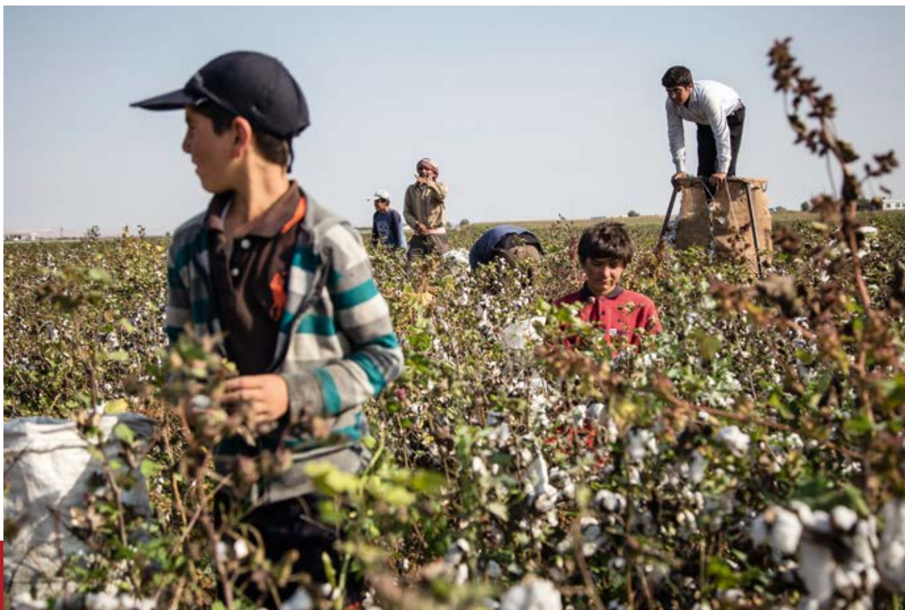
Turkey: children harvesting cotton