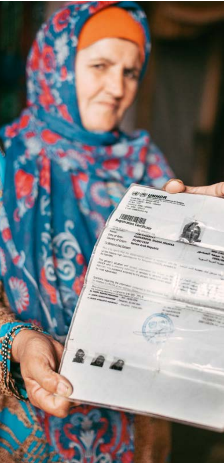
Together with her daughter she had to flee Syria in 2014

Within Syria, humanitarian partners providing assistance across the operational hubs (Syria, Turkey and Jordan) committed to work together under a »Whole of Syria« 24 approach at the end of 2014. 270 international and national actors have joined hands in this initiative to create a common response plan as well as a supporting coordination structure. This is aimed at reducing overlap in coverage and facilitating response by the direct and effective modalities of aid.